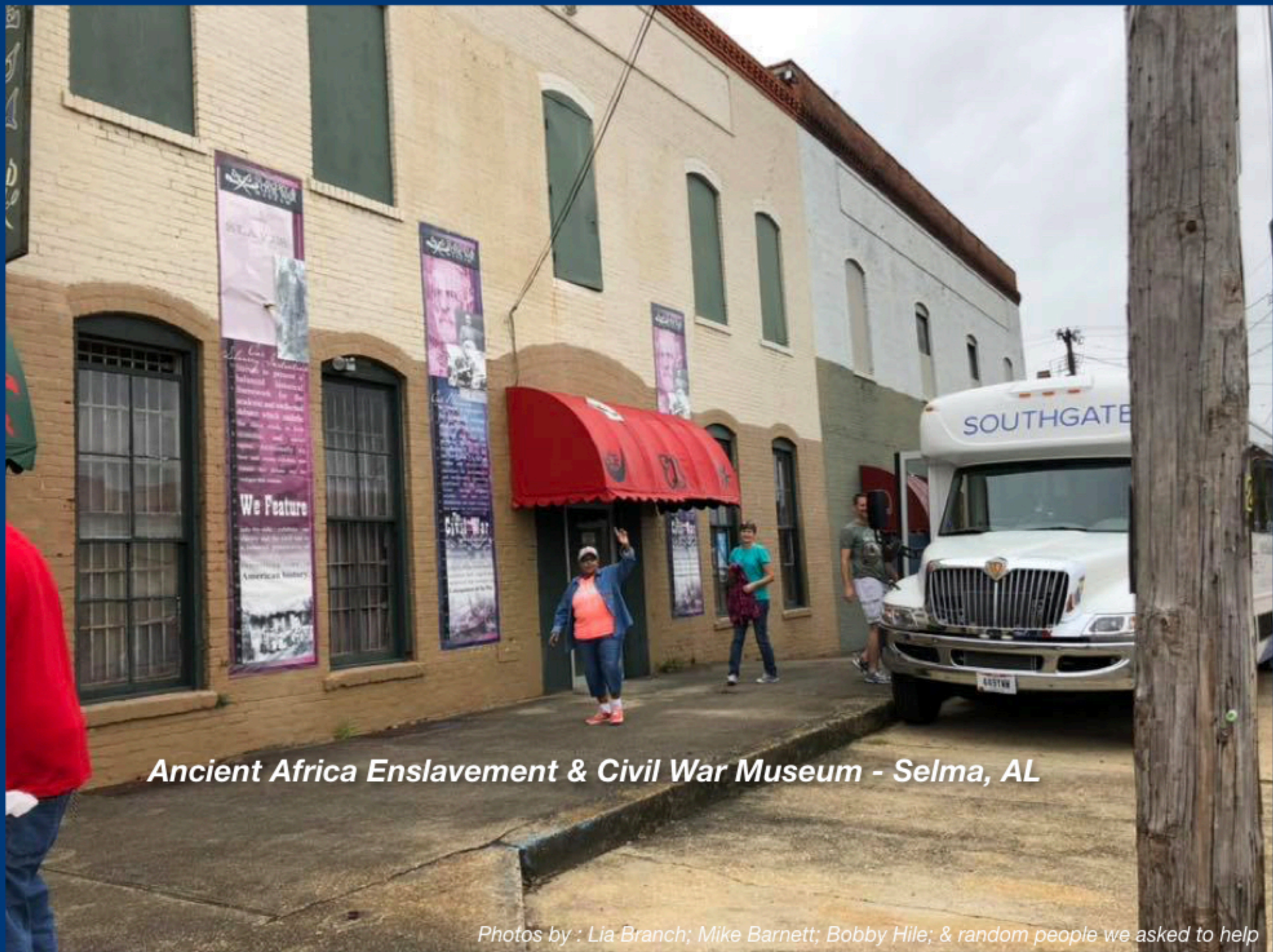
Ancient Africa Enslavement & Civil War Museum - Selma, AL